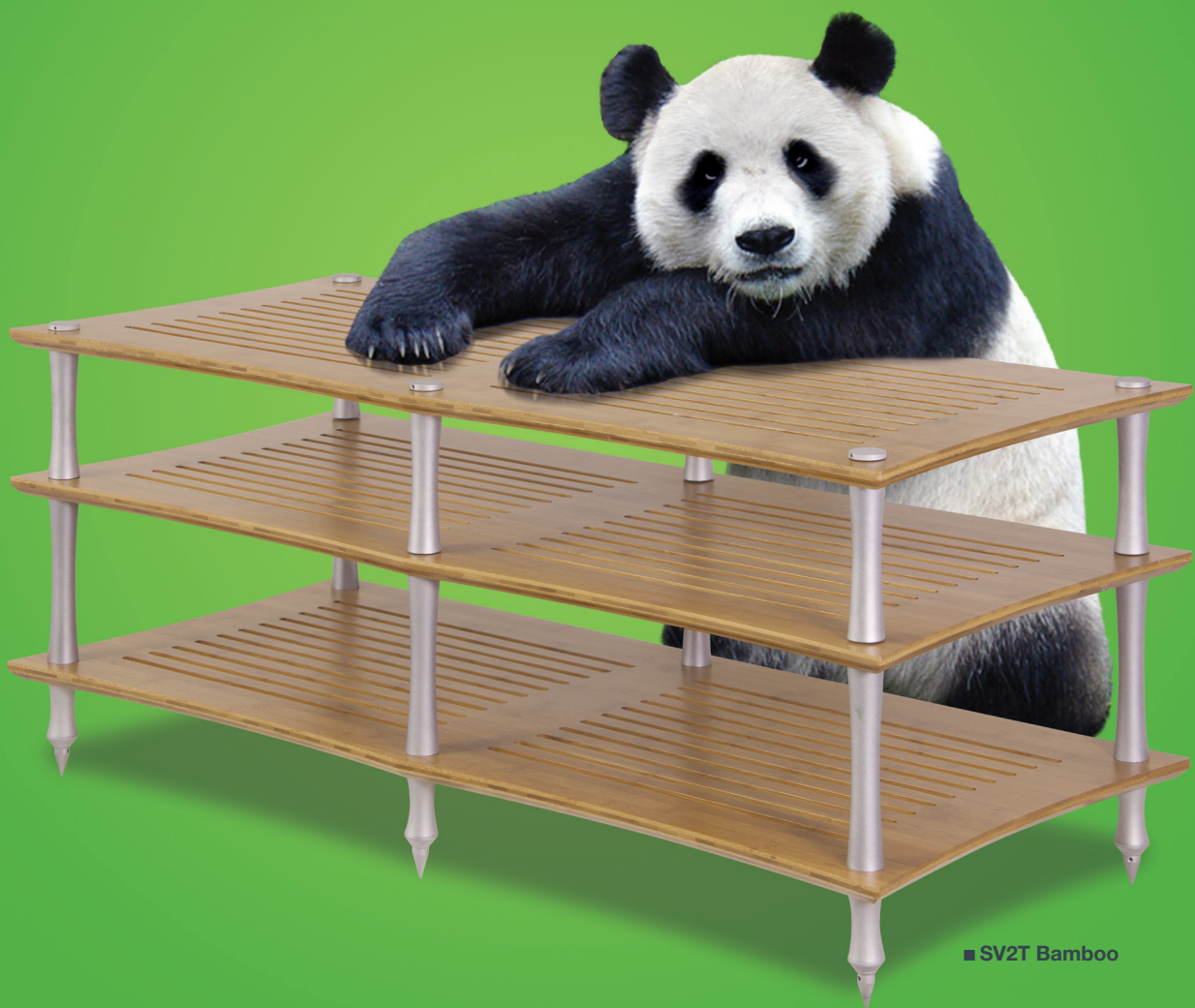
■ SV2T Bamboo